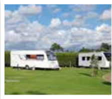
Charoland Farm near Blackpool in Lancashire (page 8)

We're very pleased to feature three new parks in our 2019 brochure: