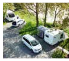
Grooby's Pit Caravan Park near Skegness in Lincolnshire (page 11)