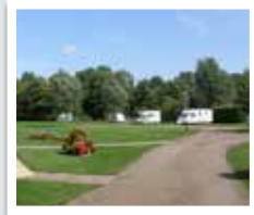
Run Cottage near Woodbridge in Suffolk (page 20)

There are more accommodation options than ever before (see centre pages) with pristine static caravans, stunning glamping lodges and cabins, and picturesque pods and shepherd huts, as well as luxury under canvas with yurts and bell tents.